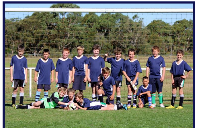
Tanilba Bay Public School Soccer Team - first win 20-5-13